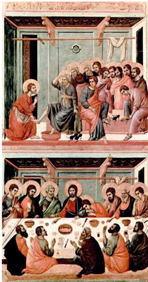
Duccio, di Buoninsegna, d. 1319. Christ Washes the Apostles' Feet (top); Last Supper (bottom), from Art in the Christian Tradition , a project of the Vanderbilt Divinity Library, Nashville, TN. http://diglib.library.vanderbilt.edu/act-imagelink.pl?RC=49249 [retrieved March 26, 2021]. Original source: www.yorckproject.de .

Maundy Thursday April 1, 2021, 7:00 p.m.